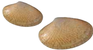
Paphia undulata Meretrix lyrata

BREEDING / OFF SEASON | HARVEST / CATCH SEASON | PEAK HARVEST/CATCH SEASON