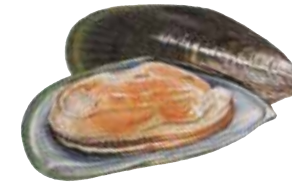
Mytilus chilensis Perna canalicula